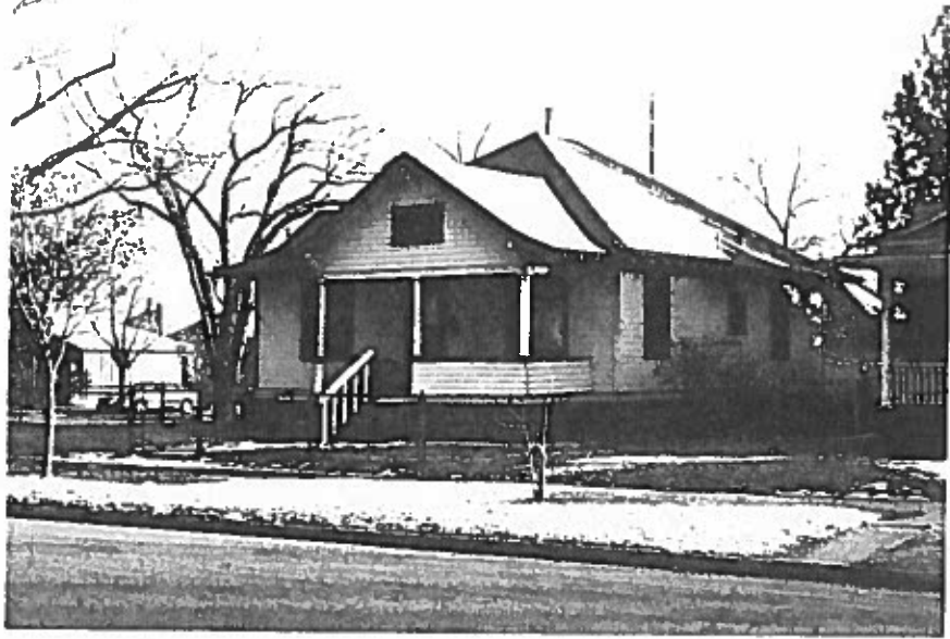
961 Chipeta Ave. , Grand Junction, Mesa Co, CO 2945-141-33-008 1/29/1996 Roll 21 Frame 04 View N Dir S/SW 5ME7929