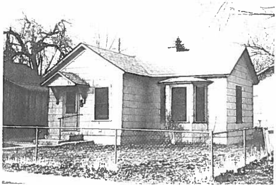
840 Chipeta Ave. (1 Of 2), Grand Junction, Mesa Co, CO 2945-141-27-015 1/29/1996 Roll 20 Frame 23 View S Dir NW SME7918