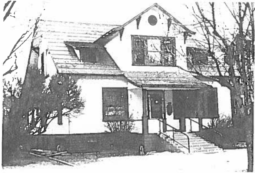
821 Ouray Ave., Grand Junction, Mesa Co, CO 2945-141-39-003 1/29/1996 Roll 22 Frame 02 View N Dir SW SME7938