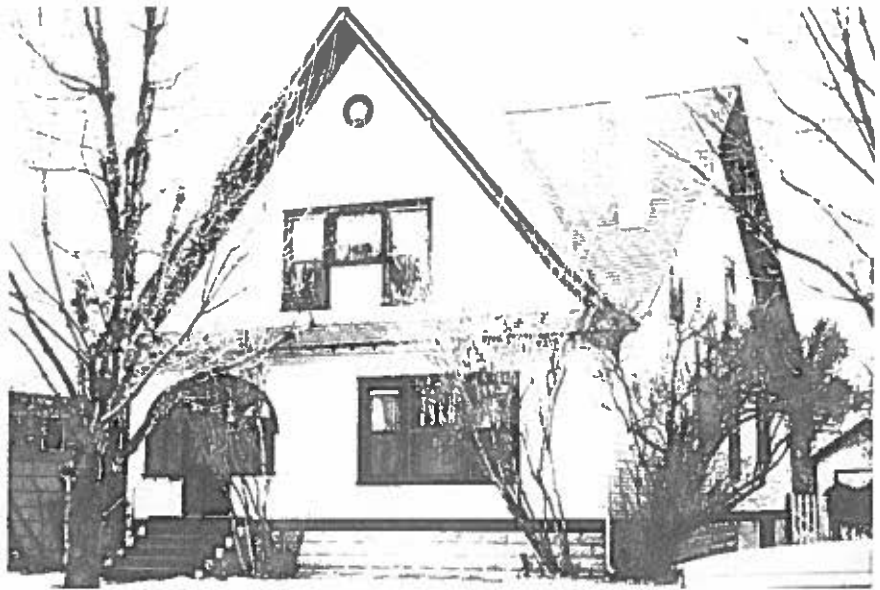
829 Ouray Ave. , Grand Junction, Mesa Co, CO 2945-141-39-004 1/29/1996 Roll 22 Frame 03 View N Dir S/SE 5ME7939