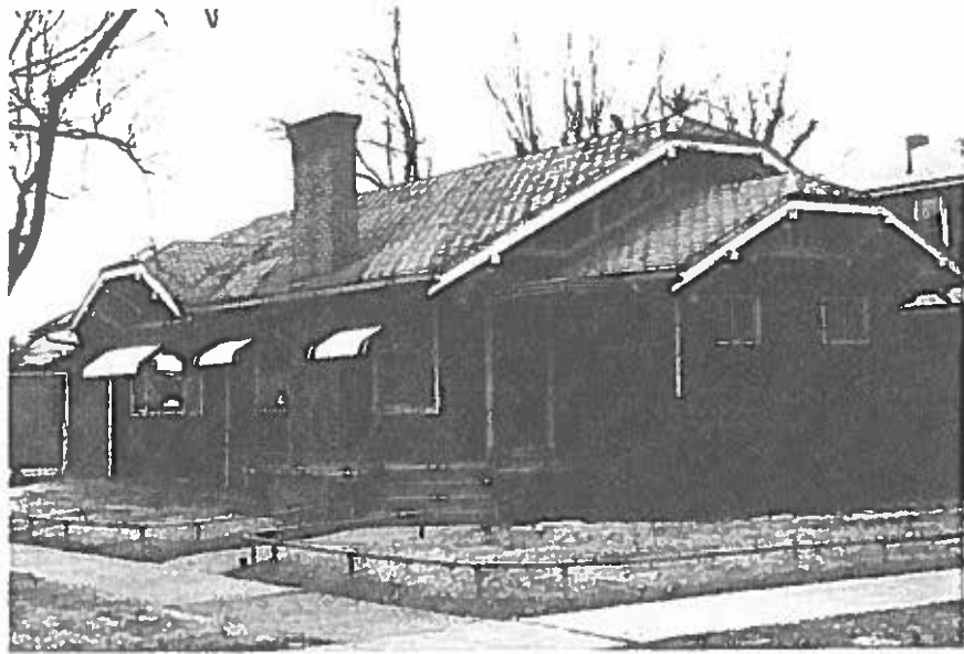
959 Ouray Ave., Grand Junction, Mesa Co, CO 2945-141-40-008 1/29/1996 Roll 21 Frame 23 View N Dir SW SME7942