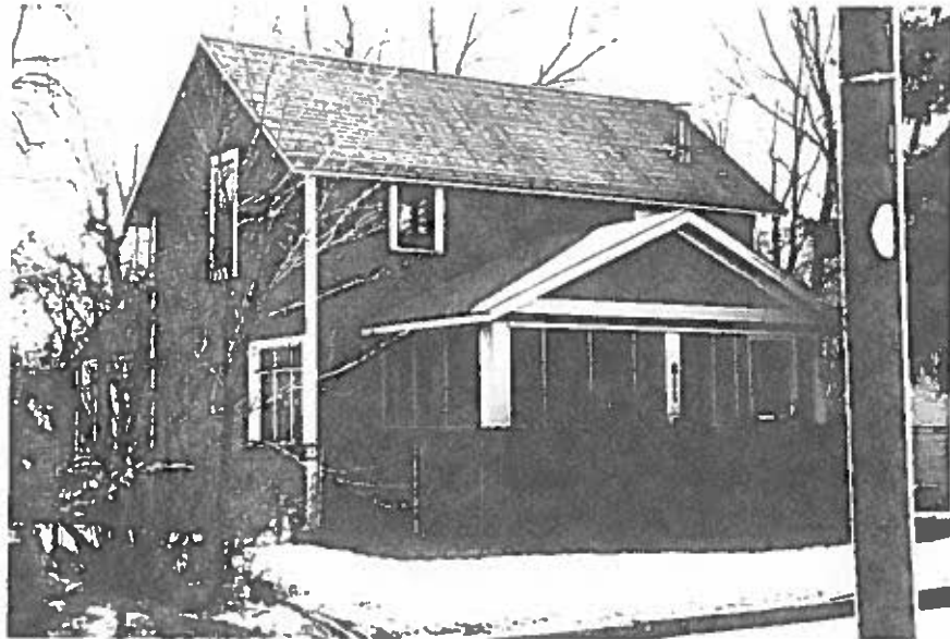
811 Gunnison Ave. , Grand Junction, Mesa Co, CO 2945-141-27-002 02/29/1996 Roll 33 Frame 9 View N Dir SW SME 8164