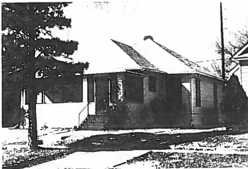
1008 Ouray Ave., Grand Junction, Mesa Co, CO 2945-141-32-010 02/29/1996 Roll 34 Frame 12 View S Dir N/NW SME 8167