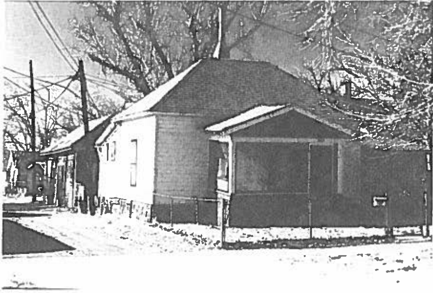
525 N. 10th St., Grand Junction, Mesa Co, CO 2945-141-33-008 02/05/1996 Roll 23 Frame 7 View E Dir NW SME 8176