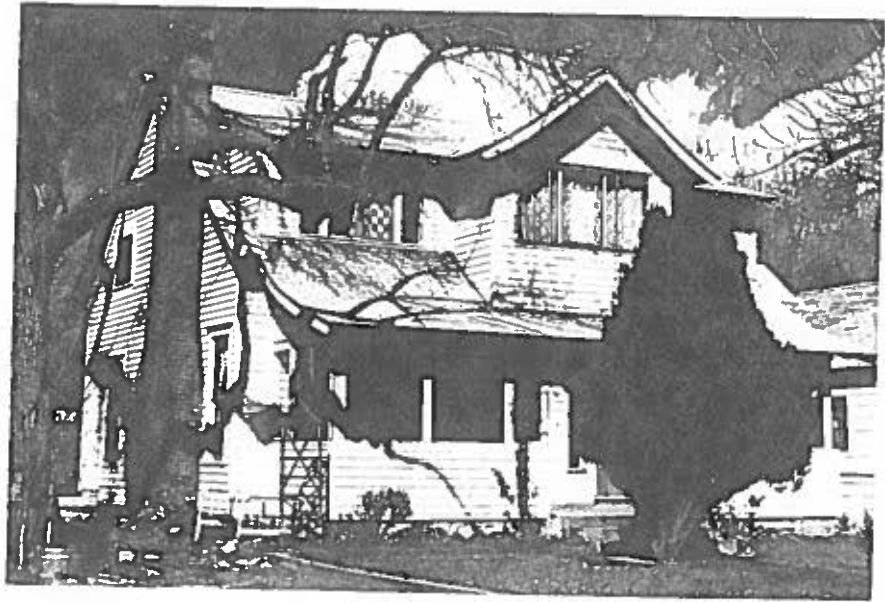
820 Chipeta Ave., Grand Junction, Mesa Co, CO 2945-141-27-019 02/29/1996 Roll 33 Frame 25 View S Dir NE SME 8407