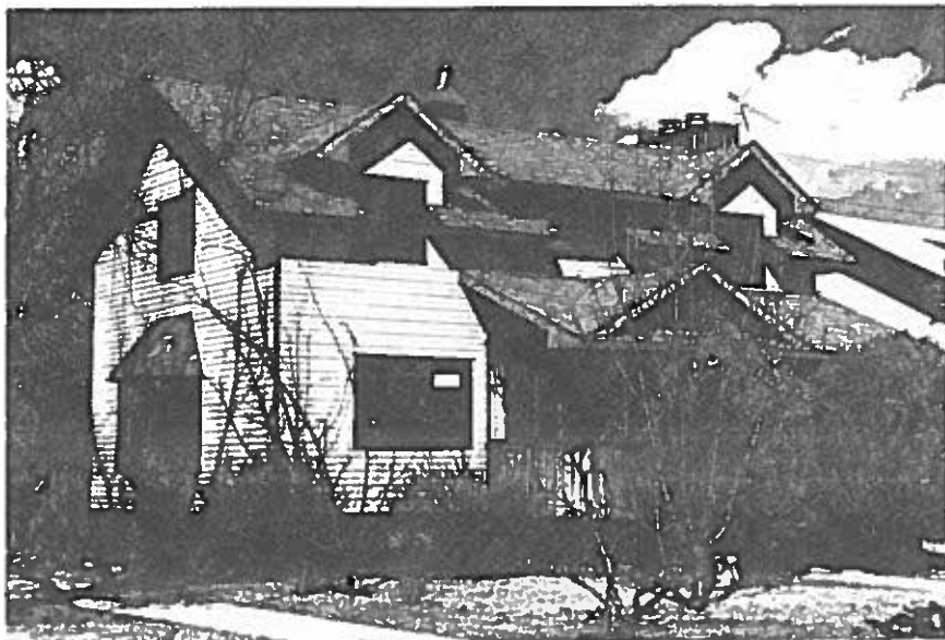
802 Ouray Ave., Grand Junction, Mesa Co, CO 2945-141-34-010 02/29/1996 Roll 34 Frame 4 View S Dir N/NE 5ME8418