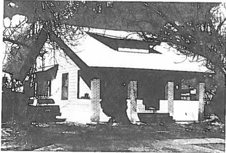
810 Ouray Ave. , Grand Junction, Mesa Co, CO 2945-141-34-011 02/29/1996 Roll 34 Frame 5 View S Dir N/NE 57E8419