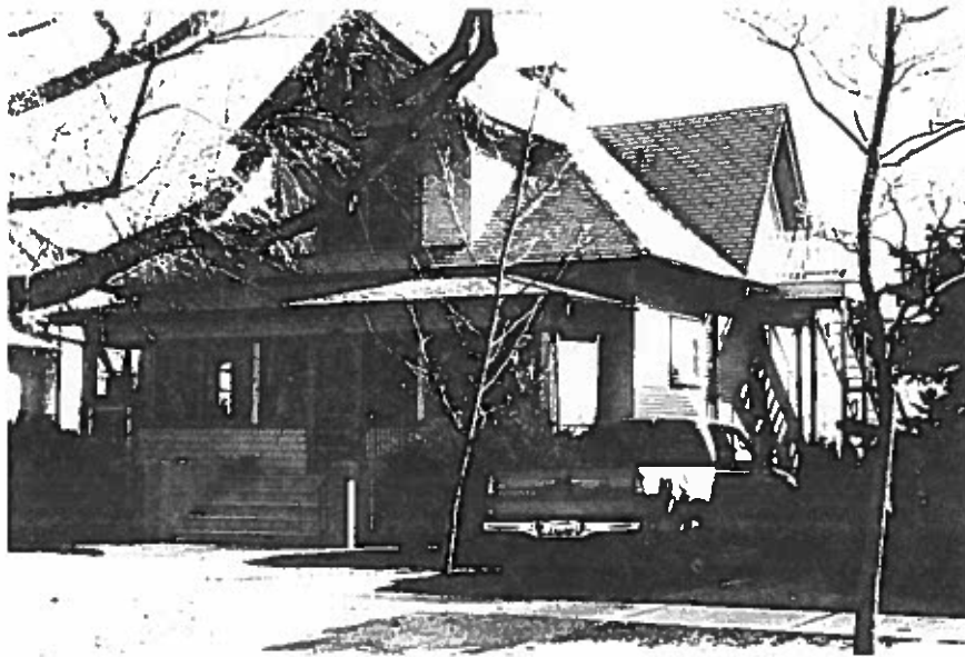
853 Ouray Ave. , Grand Junction, Mesa Co, CO 2945-141-39-007 02/29/1996 Roll 34 Frame 8 View N Dir S/SE 5mE 8424