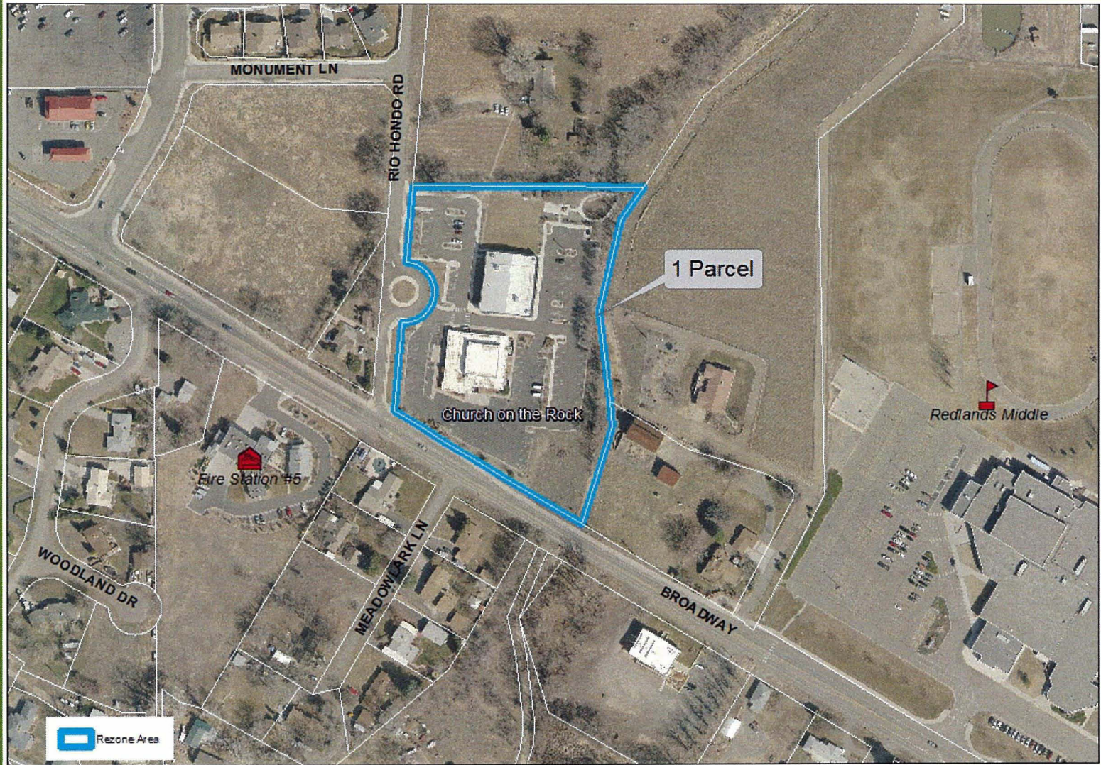
Rezone Area from R-2 (2 units/acre) to R-8 (5.5-8 units/acre)