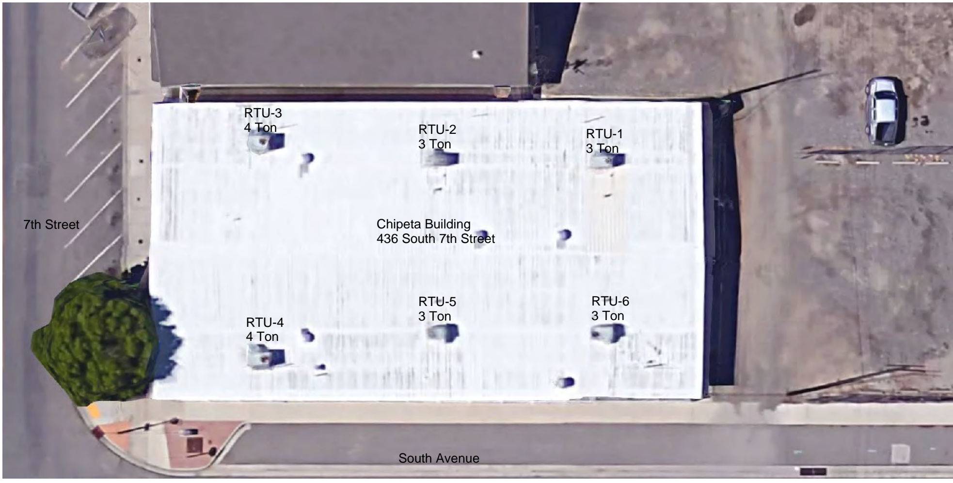
🛛 10 ft 🗆