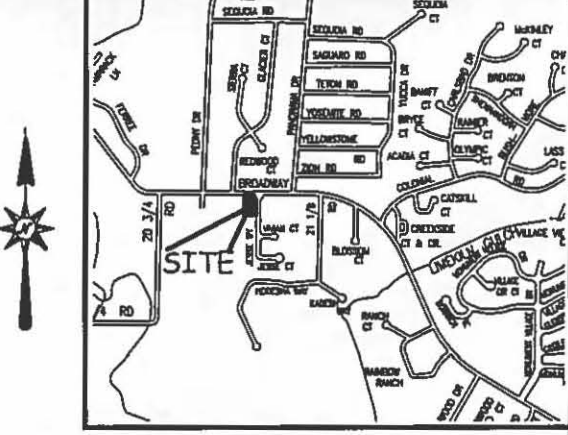
LOCATION MAP: NOT-TO-SCALE