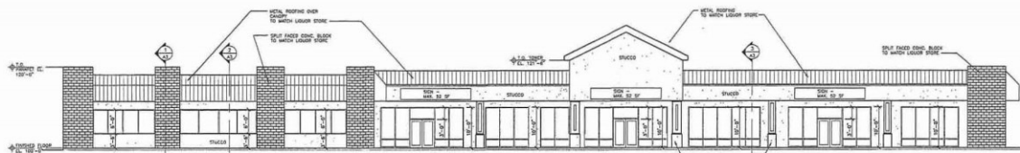
FRONT ELEVATION - SOUTH

SEE ALPHABETIC 2 VIEWS FOR ALL WINDOWS TO BE 4'-0" x 6'-0" OR 6'-0" x 8'-0" OR 8'-0" x 10'-0" OR 10'-0" x 12'-0" OR 12'-0" x 14'-0" OR 14'-0" x 16'-0" OR 16'-0" x 18'-0" OR 18'-0" x 20'-0" OR 20'-0" x 22'-0" OR 22'-0" x 24'-0" OR 24'-0" x 26'-0" OR 26'-0" x 28'-0" OR 28'-0" x 30'-0" OR 30'-0" x 32'-0" OR 32'-0" x 34'-0" OR 34'-0" x 36'-0" OR 36'-0" x 38'-0" OR 38'-0" x 40'-0" OR 40'-0" x 42'-0" OR 42'-0" x 44'-0" OR 44'-0" x 46'-0" OR 46'-0" x 48'-0" OR 48'-0" x 50'-0" OR 50'-0" x 52'-0" OR 52'-0" x 54'-0" OR 54'-0" x 56'-0" OR 56'-0" x 58'-0" OR 58'-0" x 60'-0" OR 60'-0" x 62'-0" OR 62'-0" x 64'-0" OR 64'-0" x 66'-0" OR 66'-0" x 68'-0" OR 68'-0" x 70'-0" OR 70'-0" x 72'-0" OR 72'-0" x 74'-0" OR 74'-0" x 76'-0" OR 76'-0" x 78'-0" OR 78'-0" x 80'-0" OR 80'-0" x 82'-0" OR 82'-0" x 84'-0" OR 84'-0" x 86'-0" OR 86'-0" x 88'-0" OR 88'-0" x 90'-0" OR 90'-0" x 92'-0" OR 92'-0" x 94'-0" OR 94'-0" x 96'-0" OR 96'-0" x 98'-0" OR 98'-0" x 100'-0"