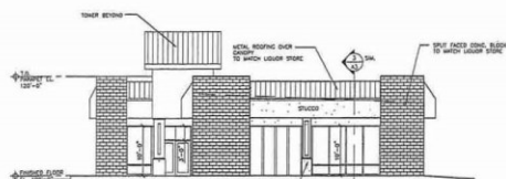
RIGHT SIDE ELEVATION - EAST (24 1/2 RD)