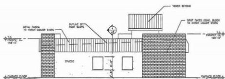
LEFT SIDE ELEVATION - WEST (HOME DEPOT)

SEE ALPHABETIC 2 VIEWS FOR ALL WINDOWS TO BE 4'-0" x 6'-0" OR 6'-0" x 8'-0" OR 8'-0" x 10'-0" OR 10'-0" x 12'-0" OR 12'-0" x 14'-0" OR 14'-0" x 16'-0" OR 16'-0" x 18'-0" OR 18'-0" x 20'-0" OR 20'-0" x 22'-0" OR 22'-0" x 24'-0" OR 24'-0" x 26'-0" OR 26'-0" x 28'-0" OR 28'-0" x 30'-0" OR 30'-0" x 32'-0" OR 32'-0" x 34'-0" OR 34'-0" x 36'-0" OR 36'-0" x 38'-0" OR 38'-0" x 40'-0" OR 40'-0" x 42'-0" OR 42'-0" x 44'-0" OR 44'-0" x 46'-0" OR 46'-0" x 48'-0" OR 48'-0" x 50'-0" OR 50'-0" x 52'-0" OR 52'-0" x 54'-0" OR 54'-0" x 56'-0" OR 56'-0" x 58'-0" OR 58'-0" x 60'-0" OR 60'-0" x 62'-0" OR 62'-0" x 64'-0" OR 64'-0" x 66'-0" OR 66'-0" x 68'-0" OR 68'-0" x 70'-0" OR 70'-0" x 72'-0" OR 72'-0" x 74'-0" OR 74'-0" x 76'-0" OR 76'-0" x 78'-0" OR 78'-0" x 80'-0" OR 80'-0" x 82'-0" OR 82'-0" x 84'-0" OR 84'-0" x 86'-0" OR 86'-0" x 88'-0" OR 88'-0" x 90'-0" OR 90'-0" x 92'-0" OR 92'-0" x 94'-0" OR 94'-0" x 96'-0" OR 96'-0" x 98'-0" OR 98'-0" x 100'-0"