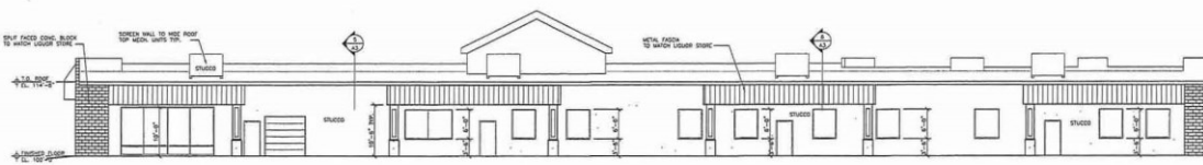
REVISED REAR ELEVATION - NORTH