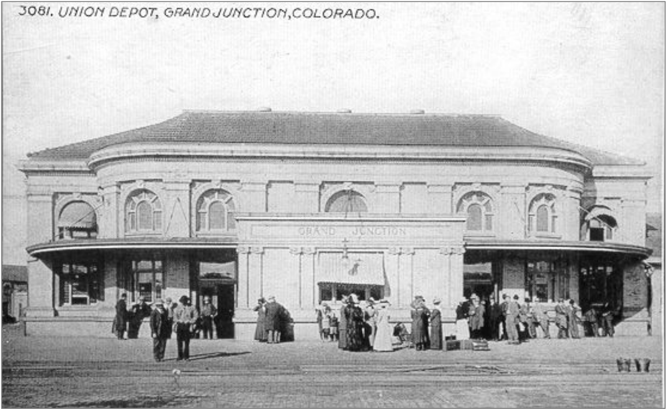
3081. UNION DEPOT, GRAND JUNCTION, COLORADO.