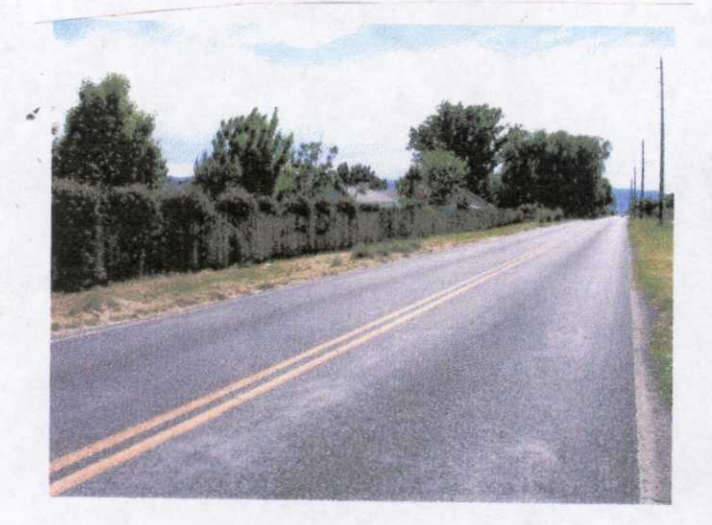
VIEW FROM 71% ROAD