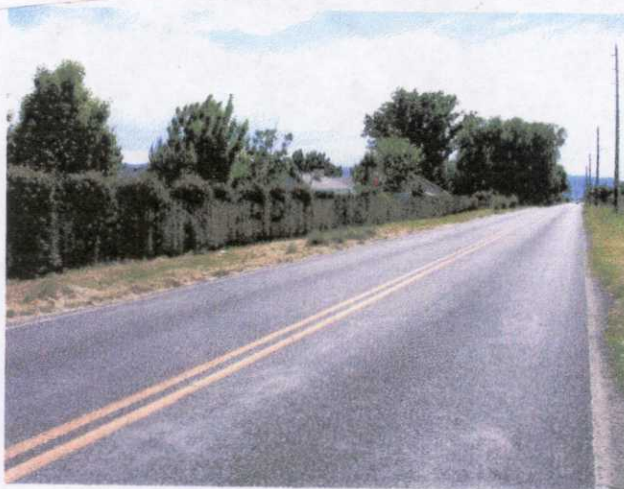
VIEW FROM 7 1/2 ROAD