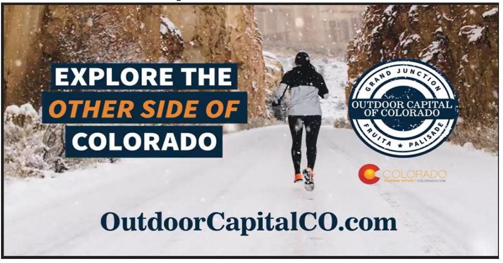
Elevation Outdoors Magazine

Billboard on 16th Street in Denver during Outdoor Retailer Show