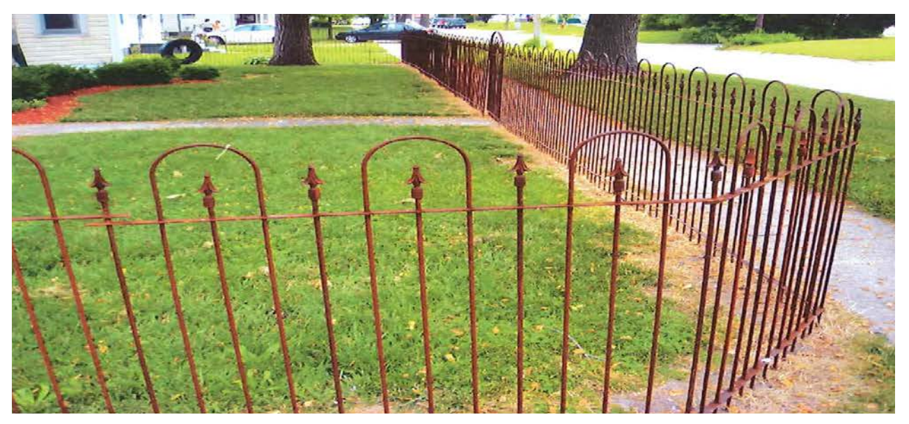
Proposed 48-inch High Wrought Iron Spear and Hoop Fencing

604 N. 7<sup>th</sup> Street Front Yards on Chipeta Avenue and 7<sup>th</sup> Street – Not Currently Fenced