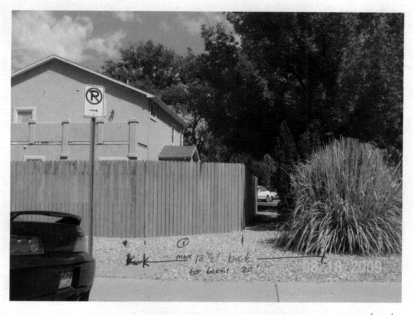
6 1/2 from base of tree to fence - must move back 13/2 feet or lower fence to 48" + remove 2 pickets. For every one picket left

1) May taper this section of Fence from 48" 44") to reach 5' height or just Leave as it is.