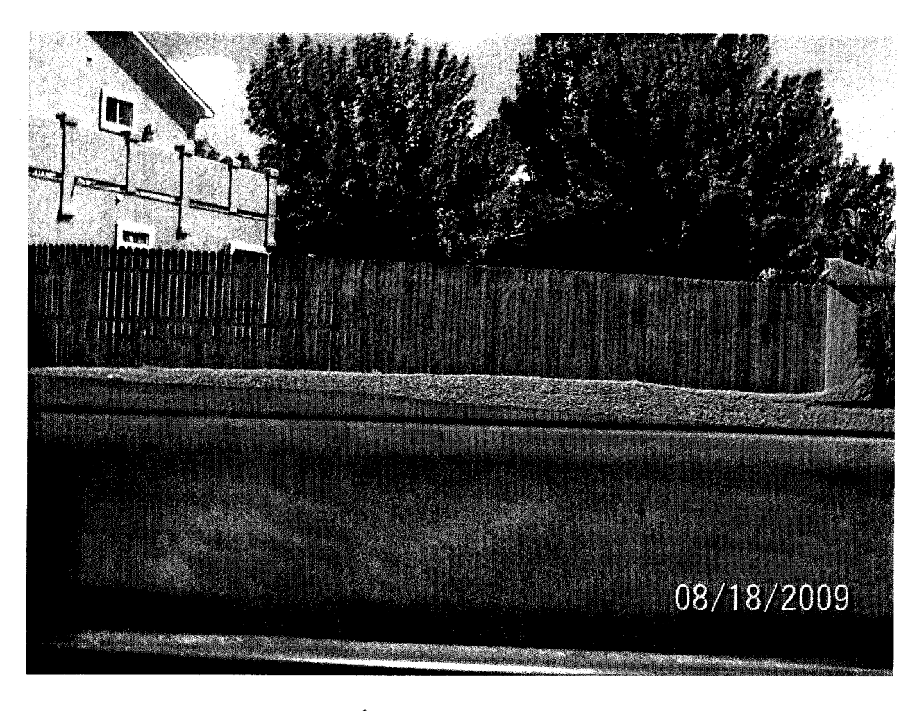
Rear view - 5' Fence OK