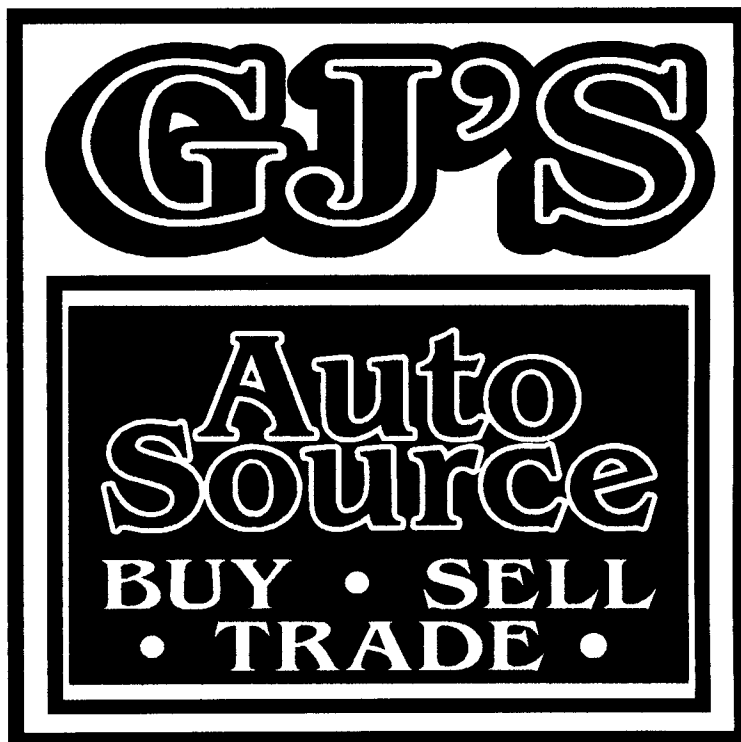
DETAIL OF MAIN ID