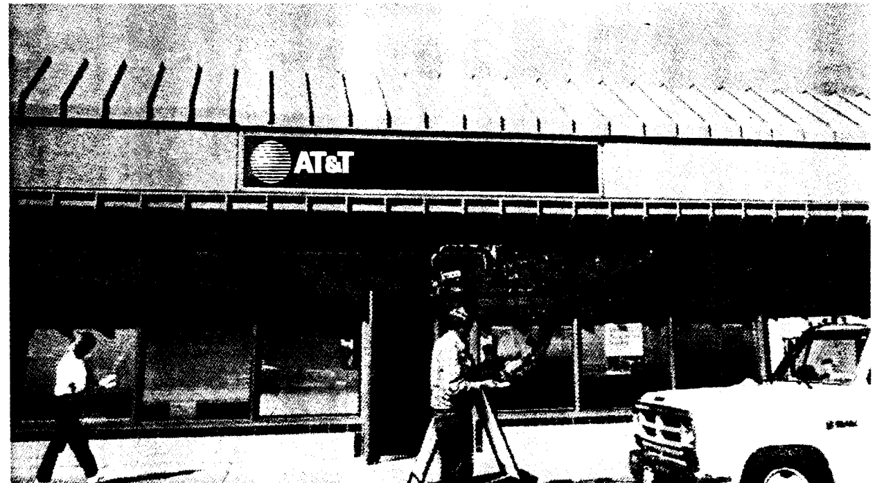
STORE FRONT SIGN ELEVATION SCALE: NTS

"AT&T" 2454 HWY 6 & 50, SUITE 106- GRAND JUNCTION, CO. EXTERIOR STORE FRONT SIGN REFACE