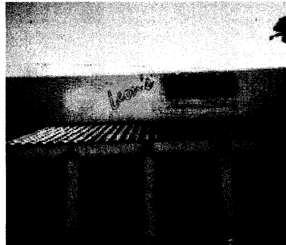
Conceptual View Of Signage

CITY OF DENVER CONTRACTOR LICENSE NO. 12016