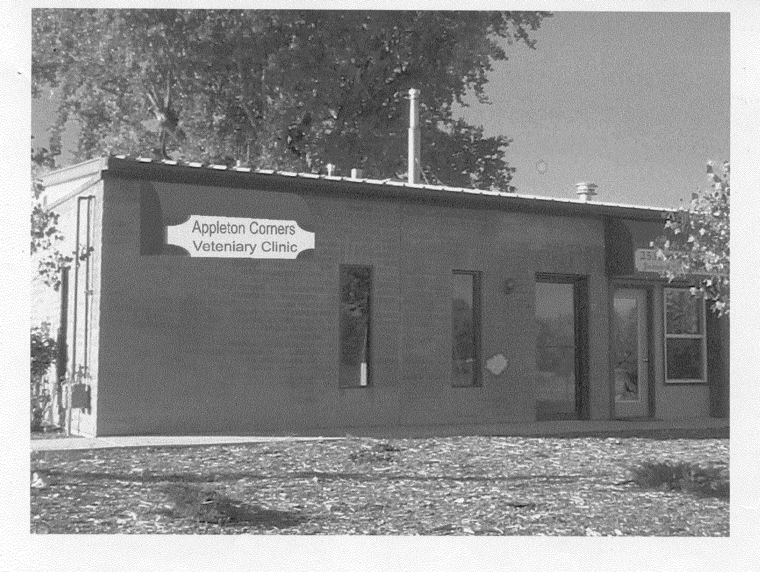
Tuesday, October 16, 2001 Canvas Products Company