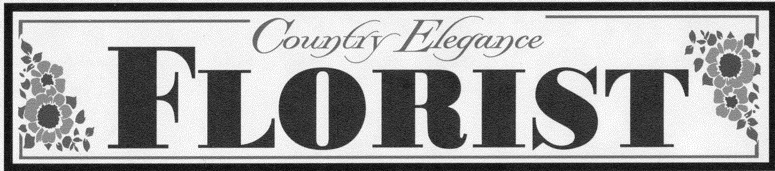
30"x12' Illuminated Sign Cabinet