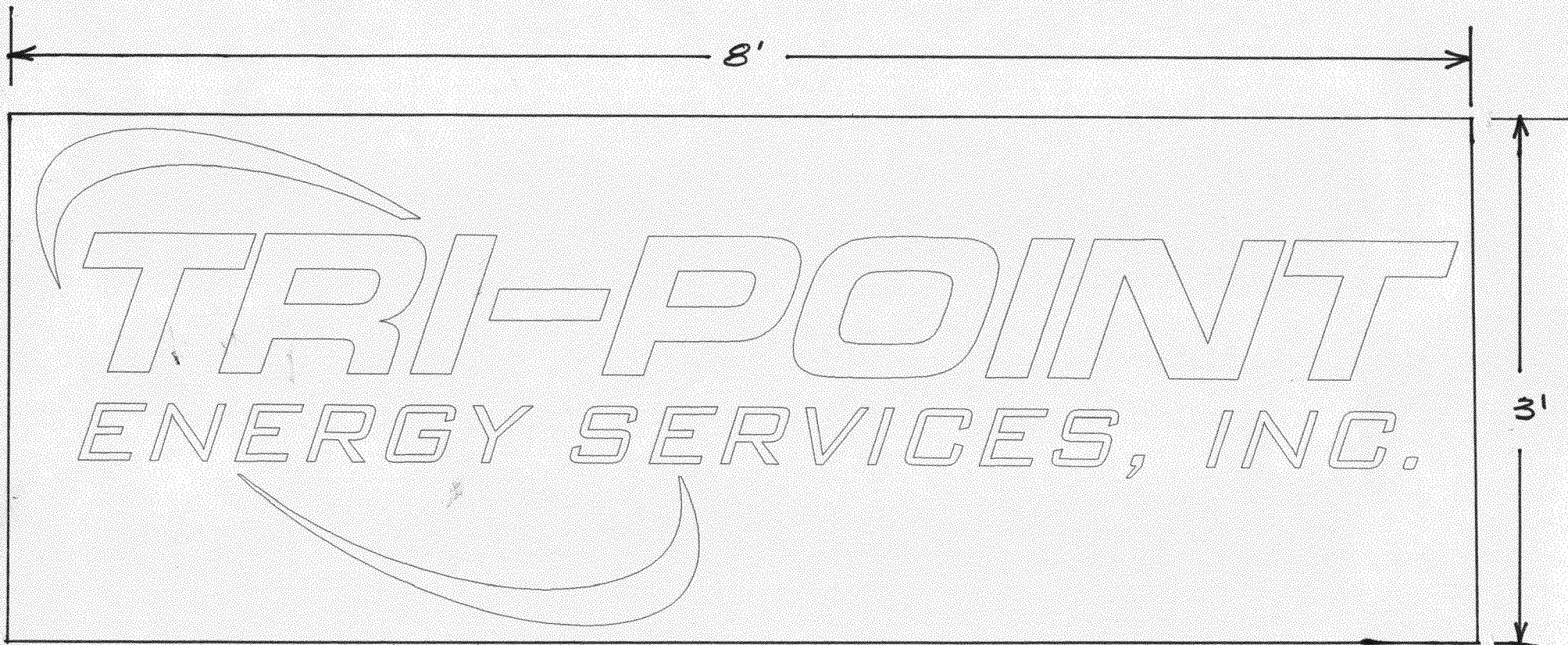
MONUMENT SIGN "B"