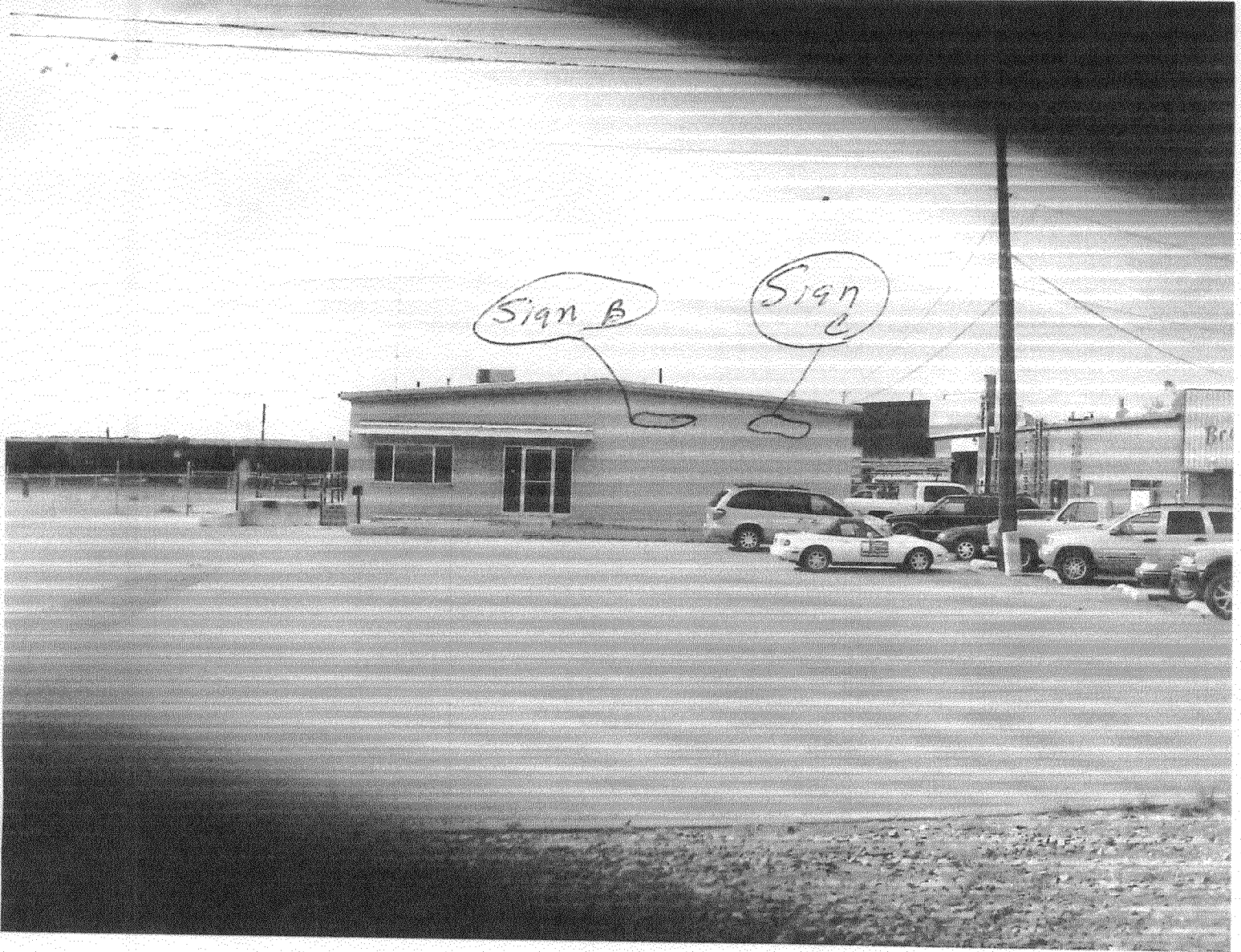
View from area between Main St + I-70 B