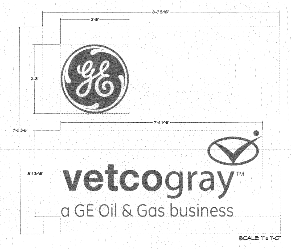
Building Sign - Illuminated - PMS Cool Gray 11 Graphics

Project Title Grand Junction CO IF Res. T. Campbell Date Revised 10/2/2008 Date Created 4/14/2008 1 of 1