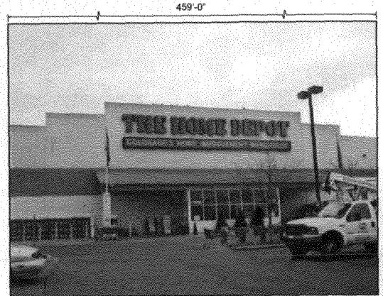
West Elevations, Current Conditions: Not To Scale