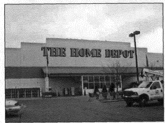
West Elevations, Proposed Conditions: Not To Scale

© Copyright 2008. This design/ engineering is to remain Atlas Sign Industries exclusive property until approved and accepted thru purchase by client named on drawing. No part of design and/or specifications maybe duplicated without written authorization of Atlas Sign Industries.