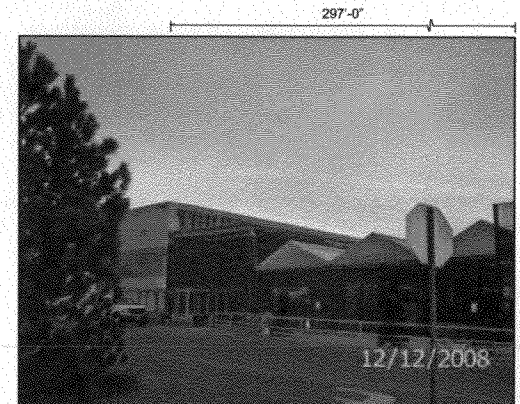
South Elevations, Current Conditions: Not To Scale