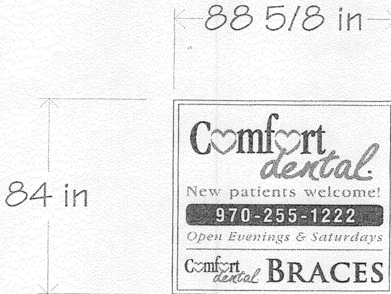
Side sign -- Grand Junction Proposed adding Braces