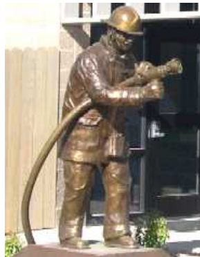
"Every Day a Hero"

Commission since 1995 asking for information about downtown's trend-setting Art on the Corner exhibit and the City's percent for art program.