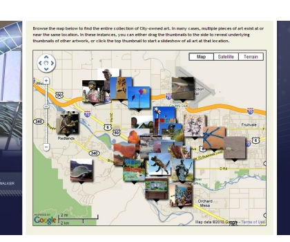
City of Grand Junction Civic Art Collection Interactive Map

profiles make the revamped site much more informative, definitely eyecatching, and user friendly.