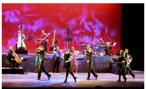
Western Slope Music Series Celtica Sinfonia Concert

City financial support reaches an audience of 60,000 —260,000 people and helps support employment, performing, exhibition, or educational opportunities for 1,500 artists or art students in Grand Junction!