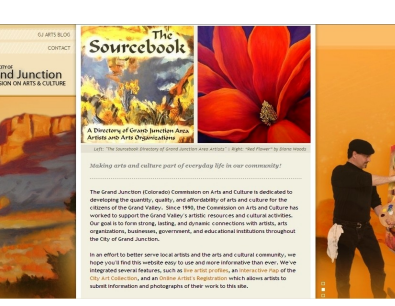
The Commission's gjarts.org website, designed by Monument Graphics

► Last summer the Commission launched its redesigned and vastly improved website gjarts.org , to better showcase local artists and arts organizations, the City's excellent civic art collection, and other Commission projects.