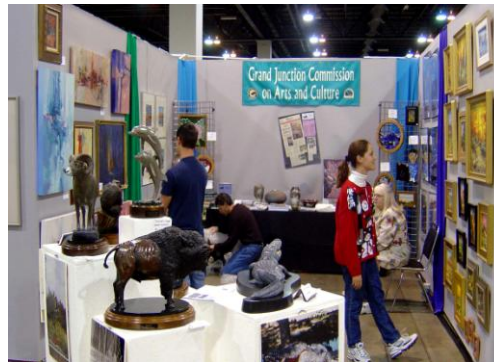
Commission booth at the Colorado Art Expo

As part of the Expo, the Cultural Arts Coordinator spoke on The Arts and the Economy panel at the “Arts Café”, offering statistics from the Commission’s report on the Economic Impact of the Arts in the Grand Valley .