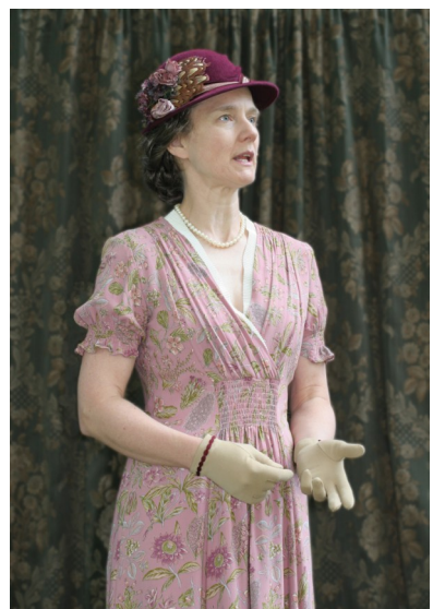
Two Rivers Chautauqua "Eleanor Roosevelt" Performance at Cross Orchards Historic Site

The arts and cultural community received $39,000 in financial support from the Arts Commission, made possible by funding from the City and the Colorado Council on the Arts.