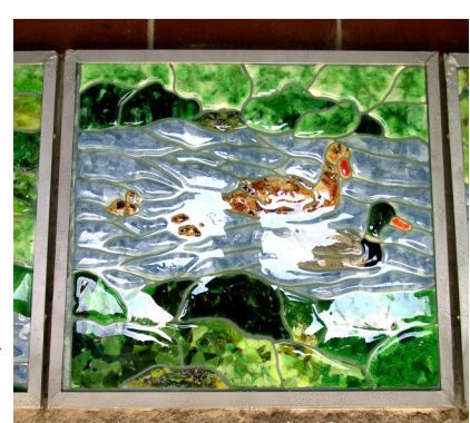
Detail of Duck Pond Park tile mural by Lylamae Chedsey

Two sculptures in the downtown Art on the Corner exhibit were purchased for two other City parks —