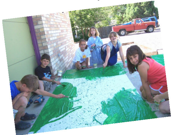
The Art Center Summer Art Camp students

Commission funded arts and cultural activities reached an estimated audience of 44,000, including about 8,000 youth.