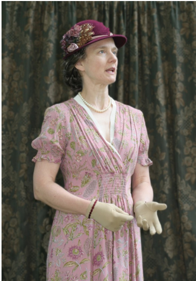
Two Rivers Chautauqua "Eleanor Roosevelt" Performance at Cross Orchards Historic Site

The arts and cultural community received $39,000 in financial support from the Arts Commission, made possible by funding from the City and the Colorado Council on the Arts.