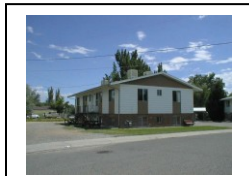
2859 Elm Cir