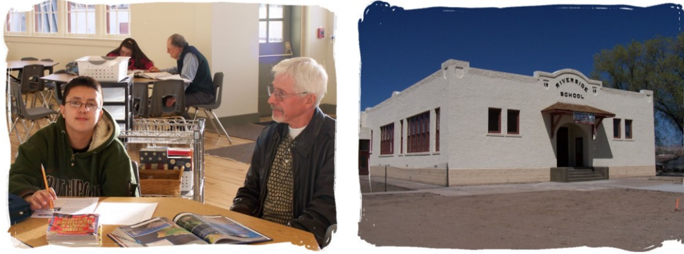
Restored c. 1918 Riverside School Community Multicultural Center