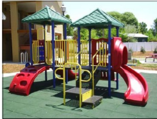
Linden Pointe Playground

IMPEDIMENT 3: A lack of affordable housing units, one-bedroom or larger, particularly for very-low and low-income households, large families with children, seniors and persons with disabilities continues to be an impediment to fair housing choice.