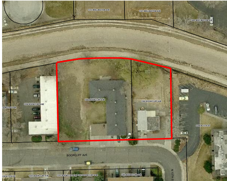
2005-07 GJHA Property Acquisition for Affordable Housing Development

Project 2005-07 The Grand Junction Housing Authority (GJHA) utilized $120,000 of 2005 CDBG funds reallocated from the City's Neighborhood Program towards purchase of 0.87-acre property located at 1262 and 1282 Bookcliff Drive (see aerial photograph site location map below. The purchase was finalized in May 2007. The property will be developed by the Grand Junction Housing Authority for multifamily affordable housing units.