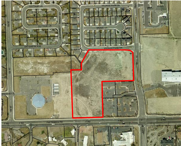
2006-02 GJHA Property Acquisition for Affordable Housing Development

Project 2006-03 Grand Valley Catholic Outreach (GVCO) was awarded $100,000 2006 CDBG funds towards construction of 22 multifamily housing units for low-income and chronically homeless individuals and a resident manager apartment. The complex of 3 structures is presently under construction at 217 White Avenue (see aerial photograph site location map below). The project is being constructed and will continue to be operated by Grand Valley Catholic Outreach.