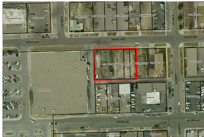
2006-03 GVCO Housing for the Homeless Development Site

NOTE: While this project will still be completed by Grand Valley Catholic Outreach, the City of Grand Junction will be completing a Plan Amendment to transfer CDBG funds from this project to a public infrastructure project. Consequently, this project is not included in further discussion of 2006 Program Year CDBG funds.