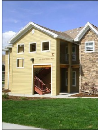
Linden Pointe Building E