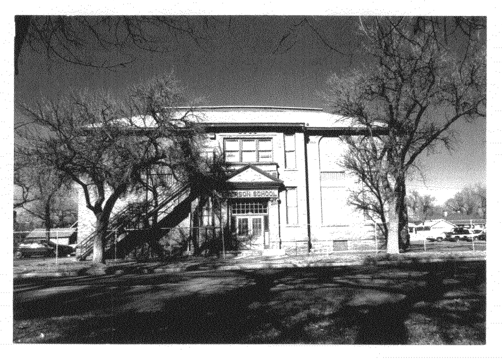
Front (south-facing) Facade