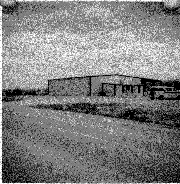
Front of MA Concrete from River Road