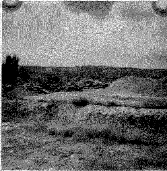
Facing SW on rear portion of MA Concrete property