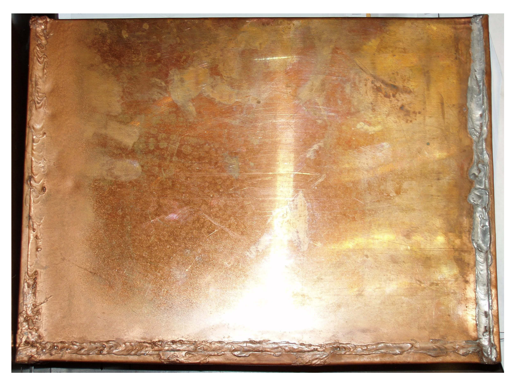
1984 Time Capsule ("casket") at 625 Ute Avenue