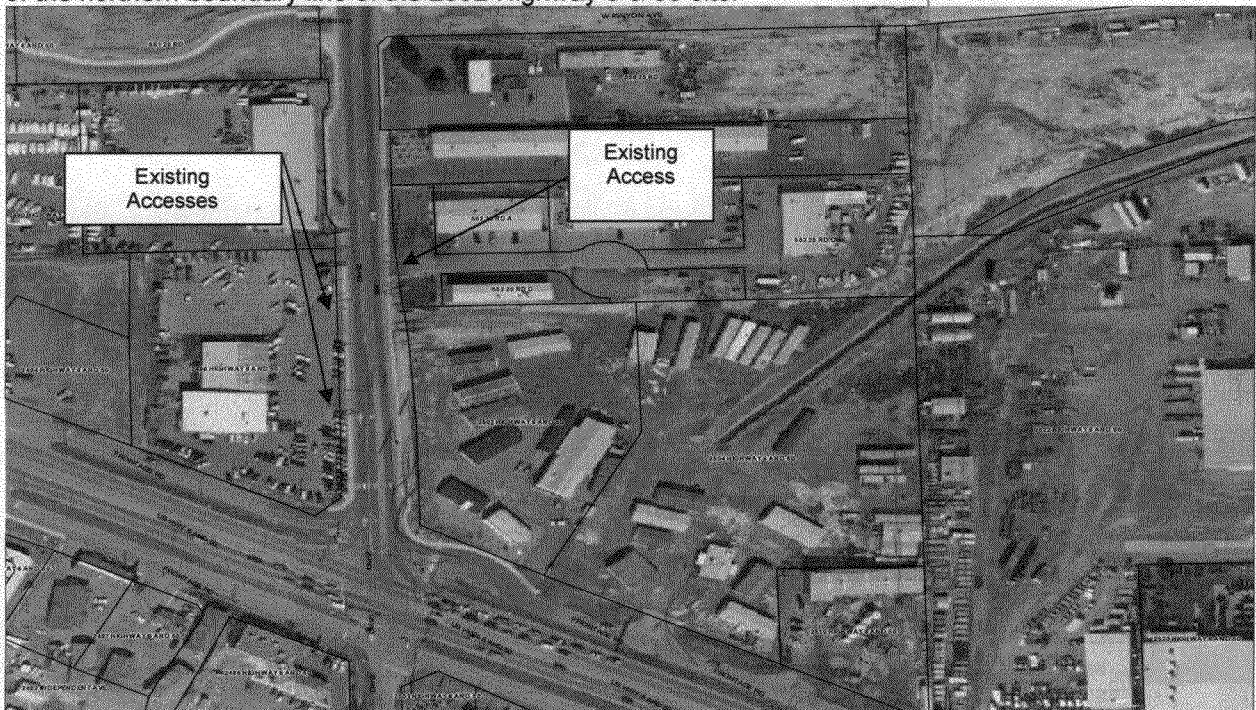
Lot 1 & Lot 2 of Riverside Crossing Subdivision

The 2502 & 2504 Hwy 6 & 50 sites are currently vacant land consisting of approximately 2.31 and 4.14 acres, respectively. The 2502 site has approximately 362-ft of street frontage along the east side of 25 Road, which is considered a Minor Arterial Street according to the Grand Valley Circulation Plan Street Classification. Currently the property directly west of the site takes access to 25 Road by (2) two driveway cuts located approximately 180-ft and 300-ft from the intersection of 25 Road and Highway 6 & 50. The property to the north gains access to 25 Road from a curb cut located approximately 53-ft north of the northern boundary line of the 2502 Highway 6 & 50 site.