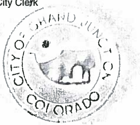
President of City Council